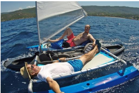
PEDAYAK TRIO & sail