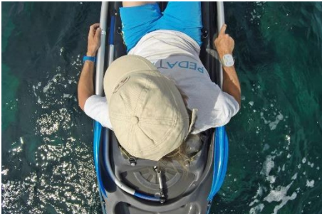
Steering control stick and helm : right or left direction