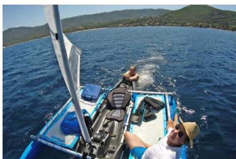
A stable sailboat allowing its pilot to relax!