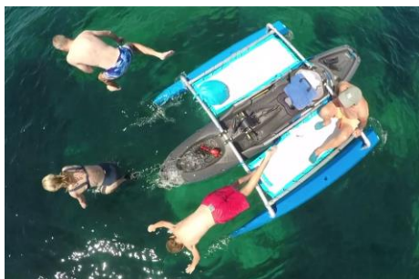
Swimming and sunbathing