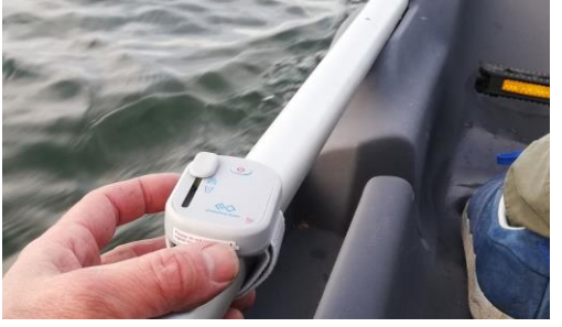
Steering control stick

Removable, waterproof, simple remote control of the engine