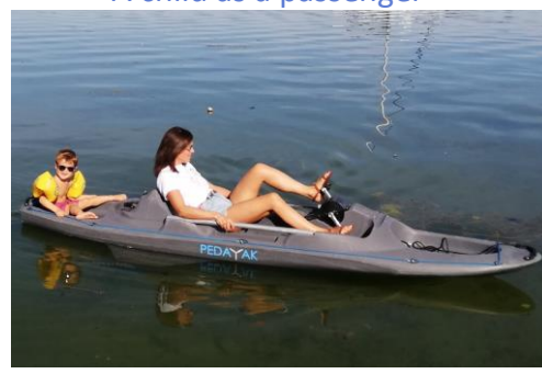
PEDAYAK TRIO ELECTRIC, trimaran